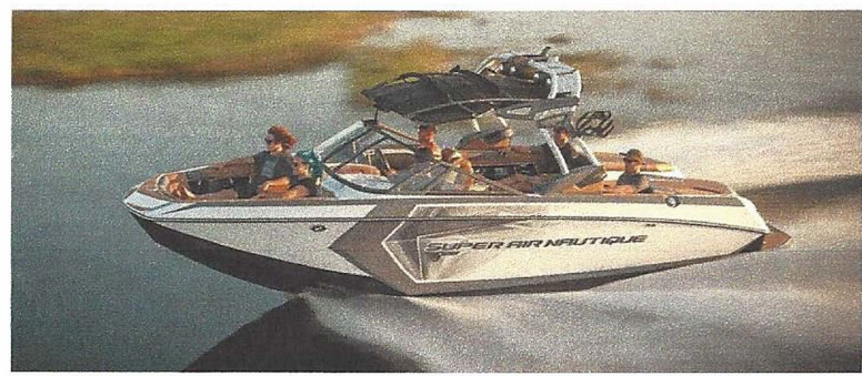
Not Actual Boat - Reference Only

(916) 638-3382 Fax: (916) 638-8282 www.superiorboatrepair.com